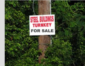
Signs placed on utility poles or trees