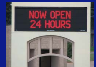
Electronic Message Center (EMC) Signs