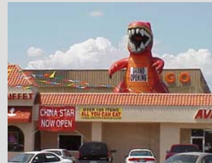
Inflatable Signs and Tethered Balloons

Flashing, fluttering, swinging, rotating, or moving signs (Examples: Air Dancers/Fly Guys)