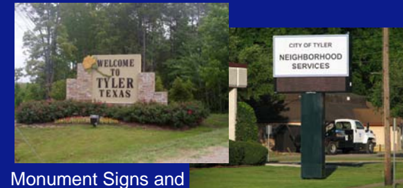
Monument Signs and Freestanding Signs