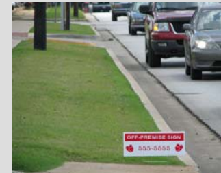
Signs placed in the right-of-way; known as Snipe or Bandit Signs