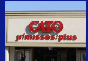
Wall or Façade Signs

Signs Permitted through the Development Services Department