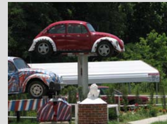
Three-dimensional or Statuary Signs