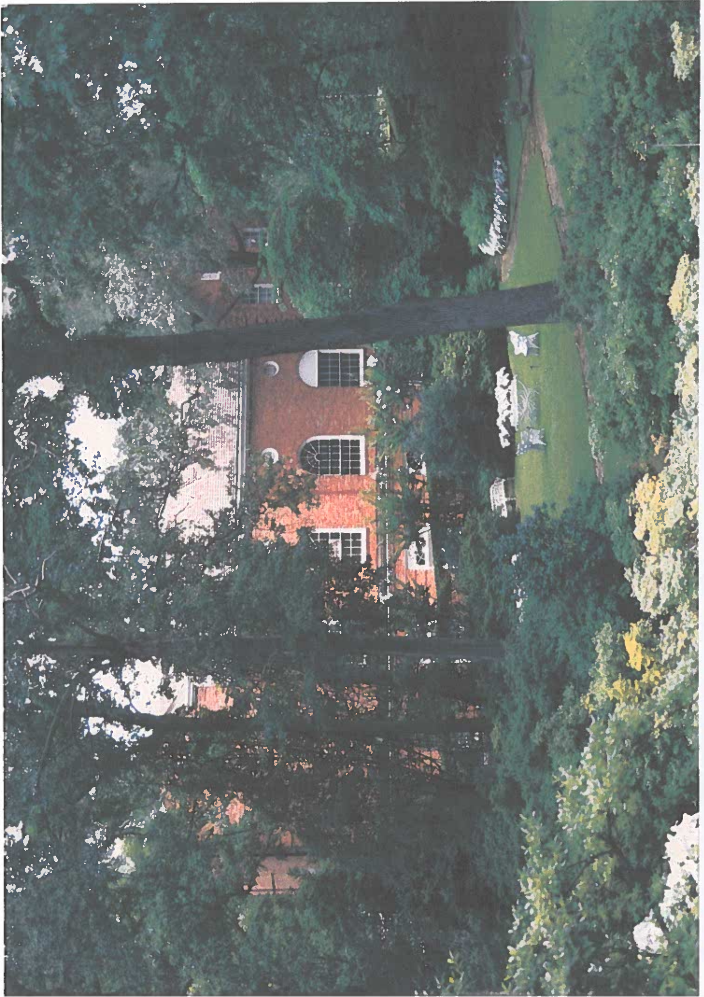
BUILDING : SOUTH SIDE VIEW