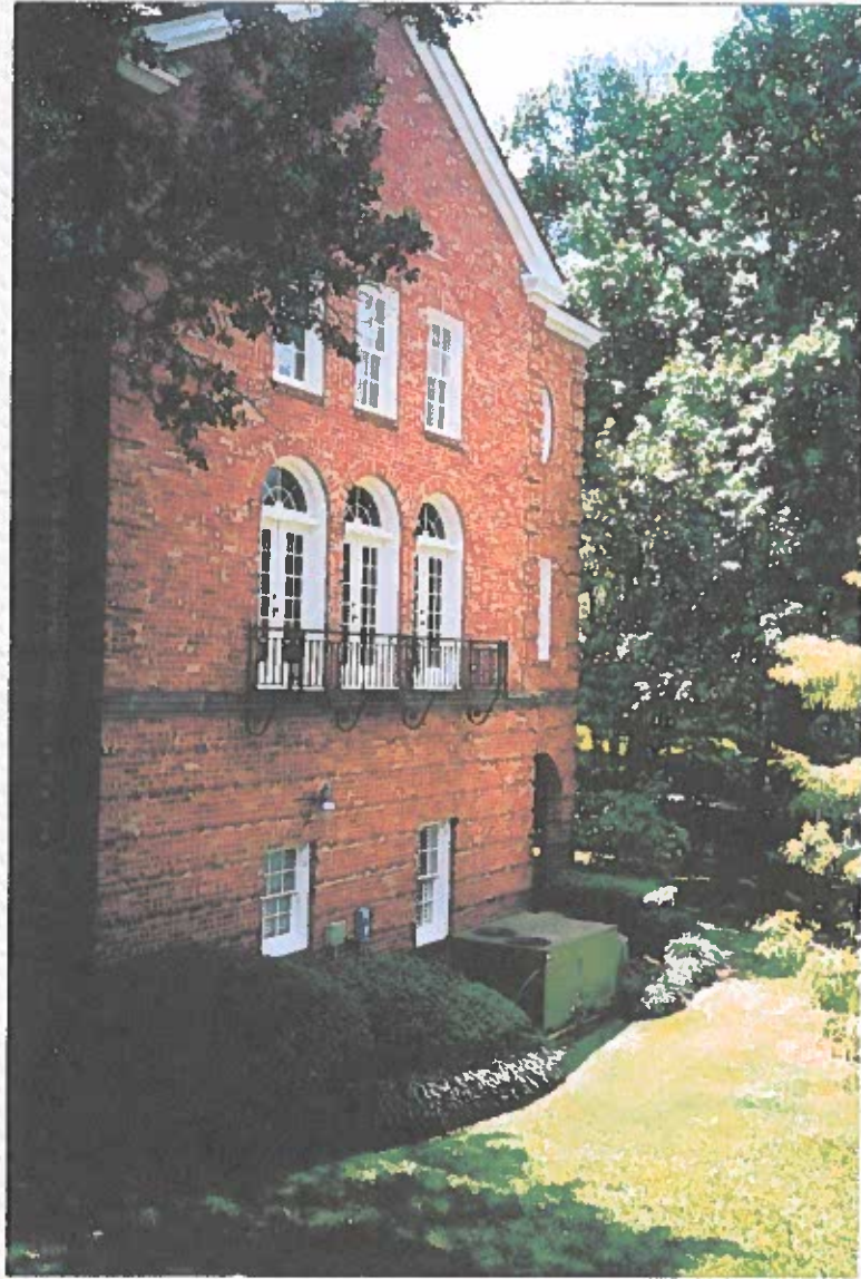
BUILDING : SIDE VIEW (NORTH)