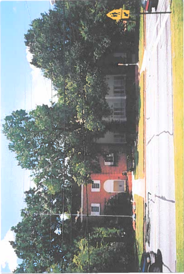
BUILDING: FRONT VIEW