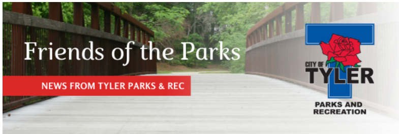
Dec. 2020 Parks & Recreation Newsletter

City of Tyler, Texas sent this bulletin at 12/01/2020 09:00 AM CST