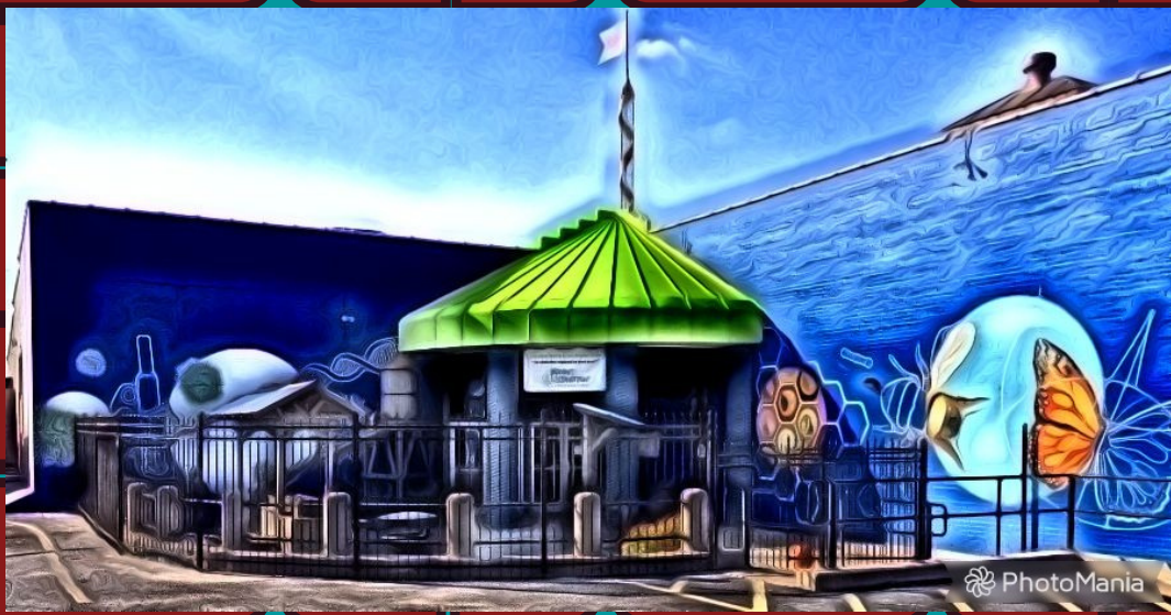
DISCOVERY SCIENCE PLACE